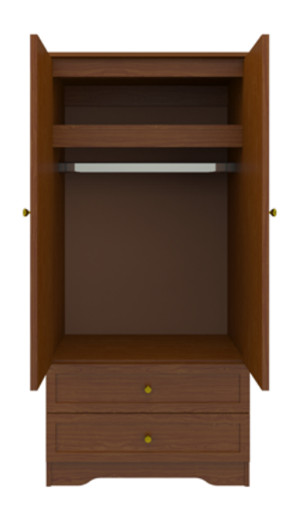
Model: LAWR22 34.5W 23.75D 71H

The Lancaster Collection offers unobtrusive refinement and skilled craftsmanship to form the perfect balance between function and beauty. Rich OG detailing on the tops and recessed insert panels set into chamfered frames on doors and drawers. Collection available with or without contrasting edges as well as custom color combinations.